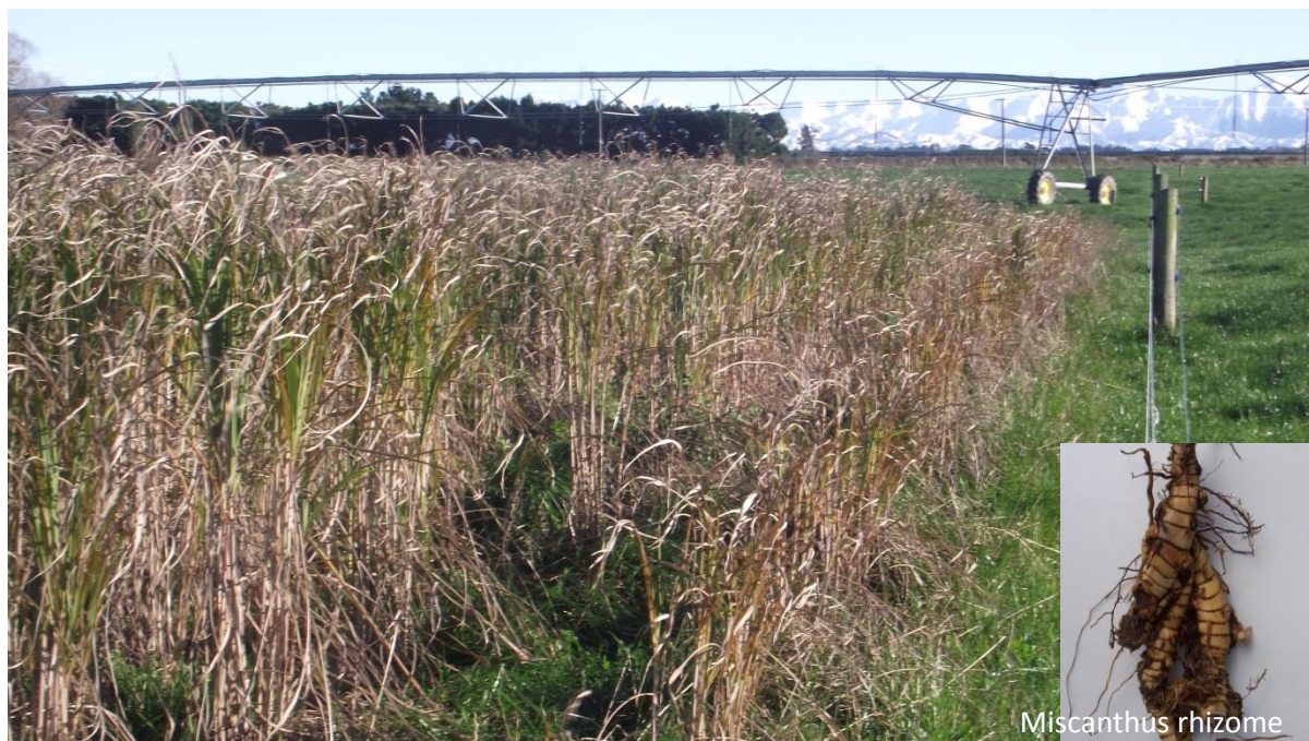
Fig.1: Senescence of Miscanthus giganteus (miscanthus) plants, 1.5 m high, at the end of June 2013; paddock 22 Aylesbury farm.