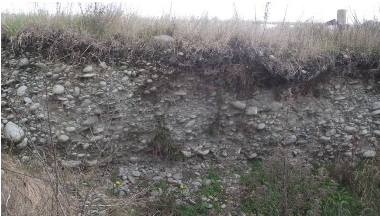
Fig. 6: Soil profile below MxG planting area at Karetu farm.