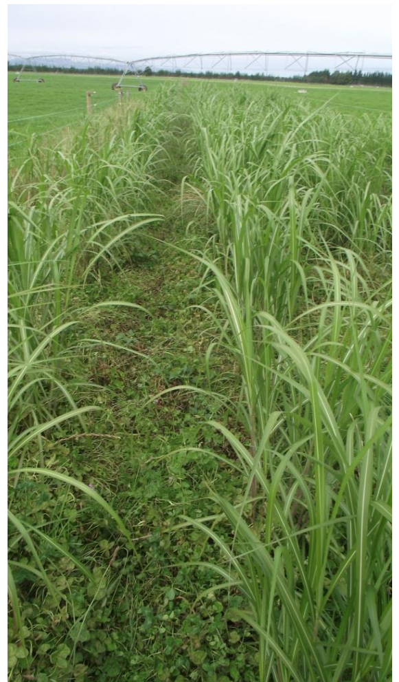
Fig.7: Sprayed area of MxG shelterbelt in paddock 21 at Aylesbury farm.