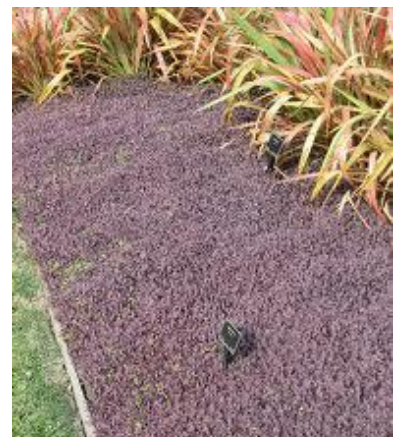
Fig.9: Acaena inermis purpurea

One of these is Acaena inermis purpurea , (Fig 9), an endemic New Zealand plant species. It has been used successfully in vineyards where it spreads well, does not compete with the crop and delivers a wide range of ecosystem services including weed suppression as well as pollen and nectar for bees, pest predators and butterflies. While the benefit for pest control on dairy farms is unclear its other attributes make trial plantings of A. inermis in future MxG stands a worthwhile addition to this research on the ecosystem services benefits of planting MxG shelterbelts on dairy farms.