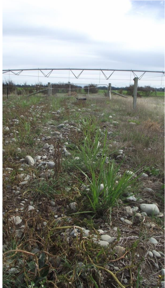
Fig.5: MxG plants at Karetu showing recent rapid growth.

The amount of new growth of the MxG plants at Karetu varies greatly as illustrated by figs. 4 and 5. Plants planted on November 27, 2013 have a higher number of plants exhibiting rapid re-growth compared to those planted on December 6, 2013. This indicates that planting earlier in the year would result in the majority of plants being able to survive summer drought conditions. What is surprising is that, even with planting so late, many plants have survived the drought especially considering the poor soil conditions found here. Fig. 6 shows the soil profile at the location of the MxG shelterbelt. This is typical of the Lismore soils found in this area which are characterised by very shallow deposits of silty loess covering a very stony substrate.