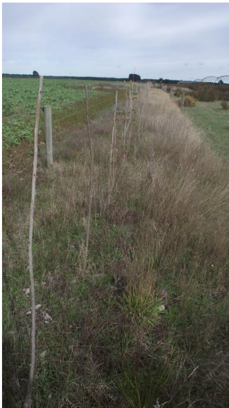
Fig. 2: Poplar trees next to the MxG plantings at Karetu farm.

Growth of irrigated plants has continued to be impressive at Aylesbury farm with some now over 1.5 m tall. Karetu farm received its first significant rainfall since February 6 on March 19 with 26 – 30 mm of rain over two days. This resulted in what were apparently dead MxG plants sprouting new shoots, indicating the robustness of this plant. Recent rainfall in early April brought about further new vigorous growth as illustrated by fig.3. In comparison the Poplar trees next to the MxG plantings, Fig.2, shed their leaves long ago and may not have survived.