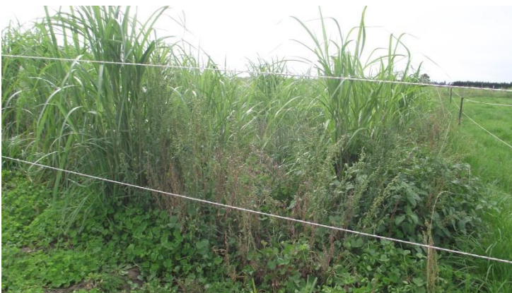
Fig.6 : Unsprayed area of MxG shelterbelt in paddock 21 at Aylesbury farm.

At Aylesbury farm, where MxG plantings have been constantly irrigated since 23 December, weed and MxG growth have continued to be vigorous. To investigate whether, in these conditions, weed competition limits MxG growth a small trial was set up. Eight similar sized areas in each of three of the MxG plantings were marked out. Four of these areas were sprayed, (Fig 7), with Turfix, a broadleaf herbicide not toxic to MxG plants, and four were left unsprayed, (Fig 6). After four weeks, over which time the MxG grew 1 cm a day, the height of twelve plants in each treatment plot were measured. This resulted in half of all the plants in each of the MxG shelterbelts being measured. The mean height differences between sprayed and unsprayed plots is illustrated in Fig. 8. The mean height of plants in the unsprayed plots was 104.9 cm and that of the sprayed plots was 105.3 cm. This indicates that well established MxG plants on irrigated dairy farms are vigorously competitive. It does not mean that weed control is unnecessary; in fact all plantings needed spraying in the early stages, especially to prevent smothering by fathen ( Chenopodium album ). However it does indicate that once a certain height is reached, and in the absence of other stresses such as drought, the deeper rooting MxG plant is less prone to the effects of weed competition.