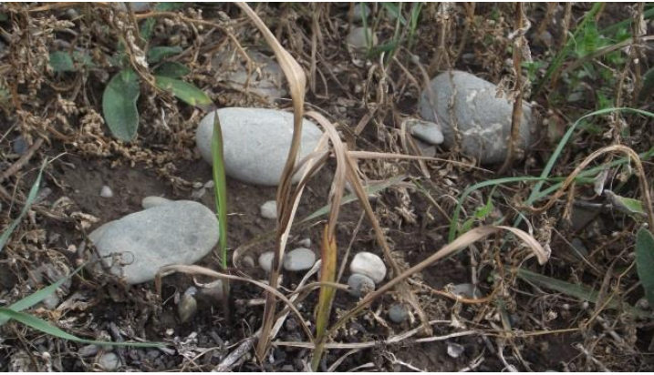
Fig.4: MxG plants at Karetu showing early signs of new growth.