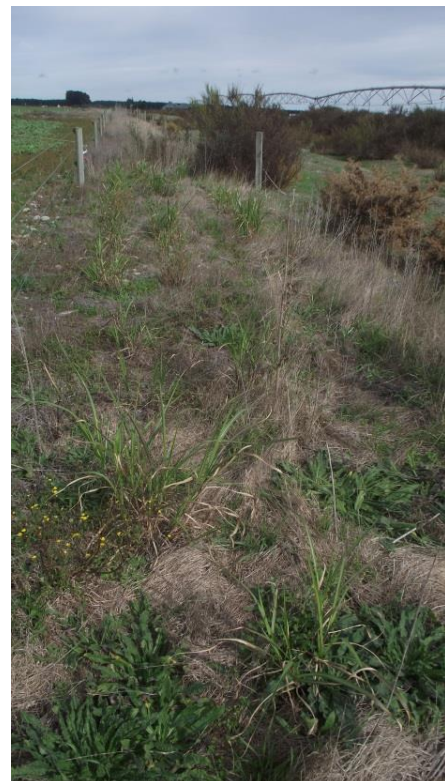
Fig. 3: New growth from MxG plantings at Karetu farm.